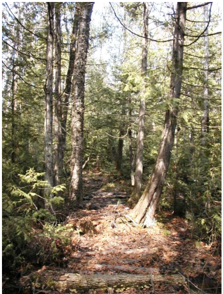
The Marsin Preserve