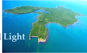
Manitou Island Light Station Preserve