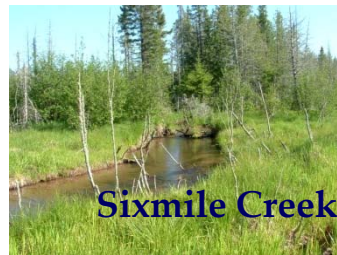
Sixmile Creek Preserve in Baraga County