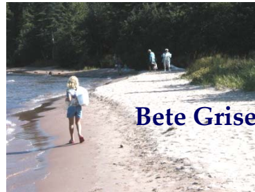
Bete Grise Preserve in Keweenaw County