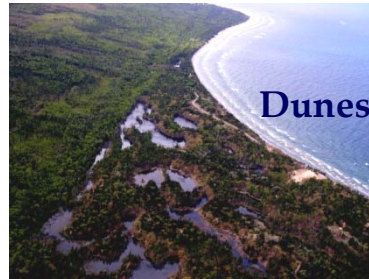
George Hite Dunes & Marshes Preserve in Eagle Harbor Township